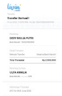
Proof of Payment.jpg 69K