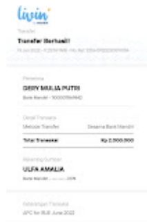
Proof of Payment.jpg 69K