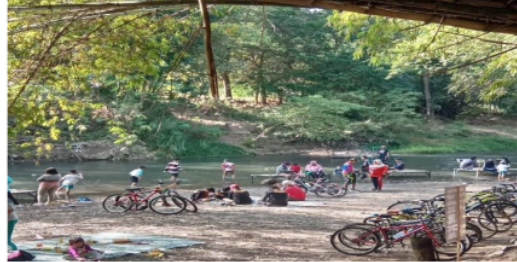
Figure 4. The riverbank of Kaligawe

Brand Positioning, Brand Personality, and Brand Identity is carried out through tourism promotion efforts with the use of mass media, both media mainstream and online media. Usually, promotions can be done in crowded places like exhibitions, music concerts, bazaars, and so on, but during this pandemic, promotions can only be done through the media, especially social media. 18 It is in line with Assenov & Khurana stressing out that social networking sites are originally used for entertainment purposes, however an increase in the use of the internet and information communication technologies has shifted the way people communicate each other, mainly in the hospitality and tourism industries. 19