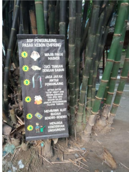
Figure 5. Health Protocol of PKE

Meanwhile, the challenges faced by the PKE management are related to a decrease in tourist visits. This certainly has an effect on the decline of the economy. One of them is in the tourism sector. One of the efforts to survive in pandemic is to make a new plan. This means that business actors must be able to keep the company alive with various promotional efforts carried out during the pandemic. In addition, more visit promotions directed at nature tourism which is indeed the location open and avoid crowds to prevent the transmission of the covid-19 virus. Selling affordable ticket prices, providing a variety of promos and discounts as well as free masks for all tourists who use our services are also carried out as an effort to minimize challenges faced during the pandemic. 20