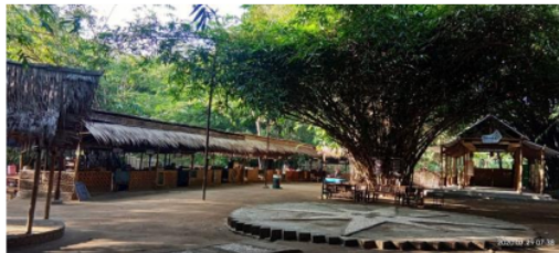
Figure 2. Pasar Kebon Empring

Brand positioning aims to create differences, benefits, advantages that make consumers always remember a product. Relation to tourism, brand positioning in the field of tourism aims to help visitors identify the unique differences between one destination with another destination. Branding is considered as the process through which a brand is established by adding capitalized value to the service of product. 15 Moreover, branding is not a method but rather an acquired image. 16