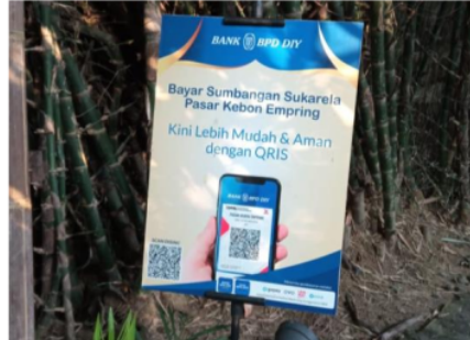
Figure 6. Contactless Payment Method