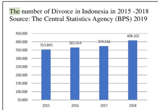
Figure 1. The number of Divorce in Indonesia, BPS 2019

The divorce trend in Indonesia is increasing every year. Based on data from the Central Statistics Agency (BPS) in 2019 as follows: