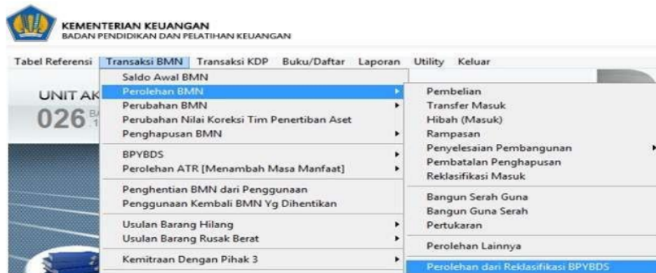
Figure Source 1: SIMAK BMN https://djpb.kemenkeu.go.id/portal/id/application-simak.html

SIMAK-BMN is carried out through a series of procedures, both manual and computerized, involving source documents such as SP2D/Contracts/BAST/Receipts, accounting organizations and accounting processes in order to produce various outputs required for both management and accountability of BMN such as Daily Transaction Details and BMN asset balances. The BMN acquisition transactions in the Simak BMN Application provide information about the sources of asset acquisition which must be recorded by the SU PSA work unit as shown in the SIMAK BMN application menu as follows: